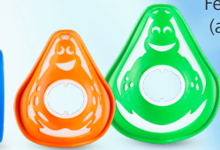
Felix Frog Mask (age 3+ years)