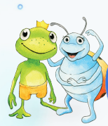
PARI VORTEX® Pediatric