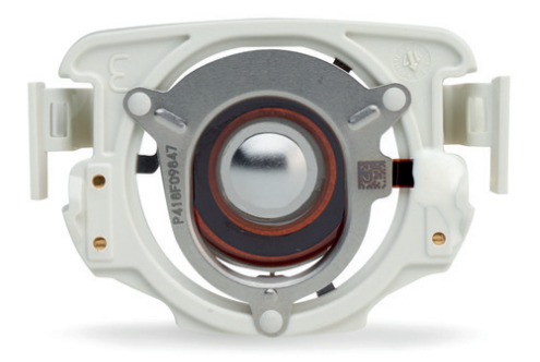
Figure 2: An eFlow aerosol head with the piezo-actuated membrane.

In the past, five established manufacturing companies provided high-quality membrane nebulisers to the market. Recently, the number of available membrane nebulisers for drug aerosolisation – i.e. with a relevant product and aerosol quality – has grown and more manufacturers have started entering the market.<sup>3</sup>