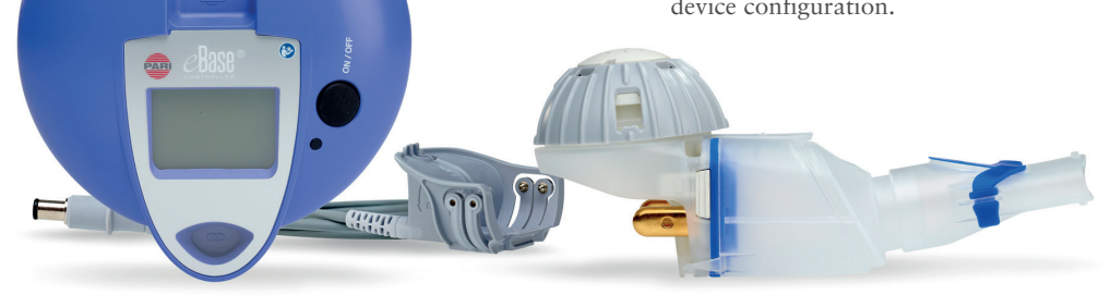
Figure 1: The eFlow Technology nebuliser – a vibrating membrane nebuliser.

company starts looking for a suitable device capable of supporting early first-inhuman studies (safety), followed by efficacy studies through to commercialisation and capable of fulfilling all the requirements arising from the different development stages. During a first screening phase, off-the-shelf available devices are tested in vitro and, preferably, a device manufacturer is contacted to prepare first steps for the development of an optimised drug-specific device configuration.